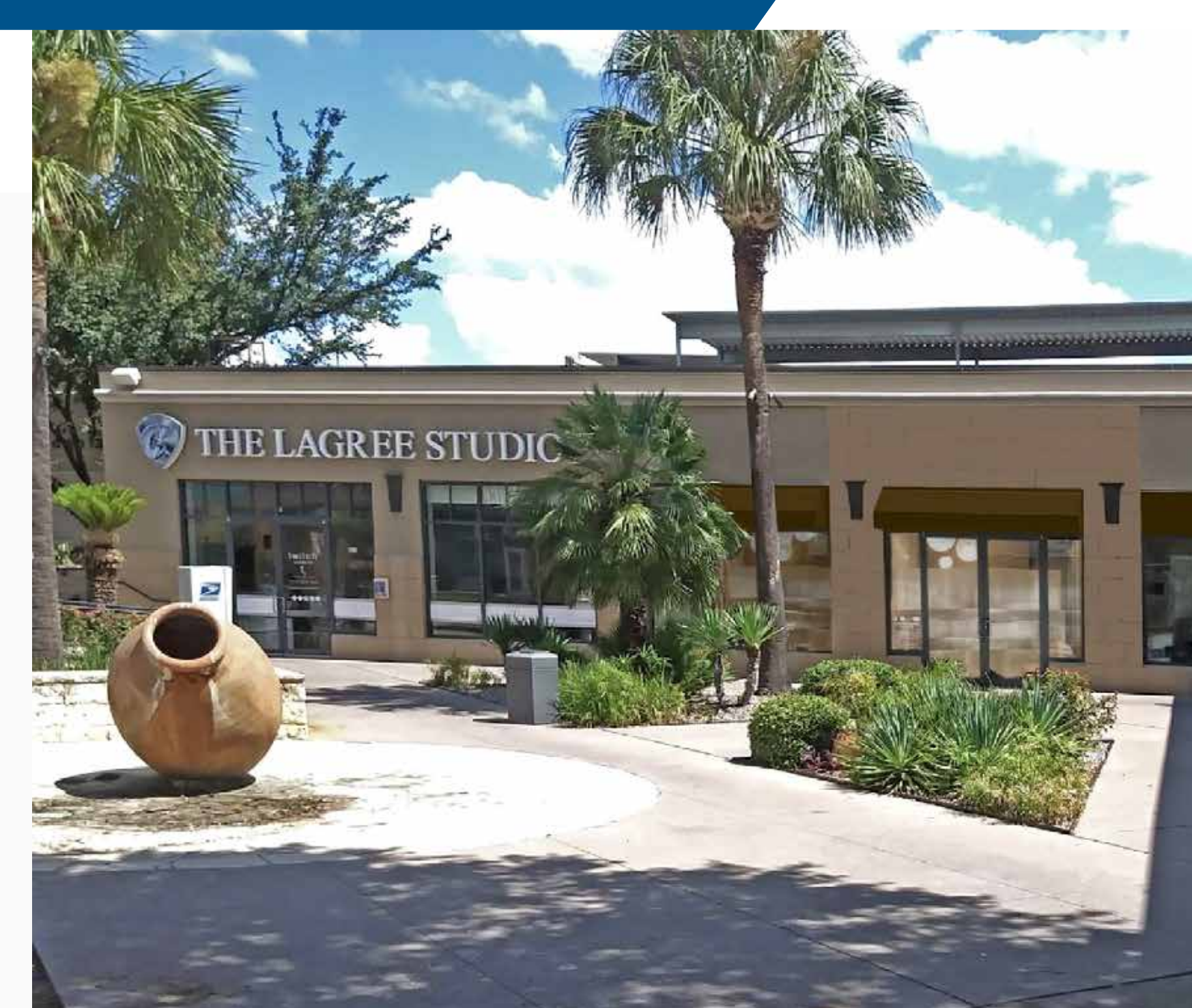
Area Retailers & Amenities